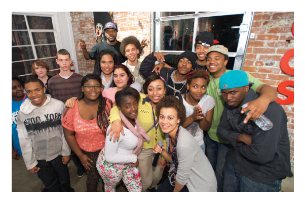
▲ At SAYS Slam, students are empowered through poetry to share their truth and make their voices heard.