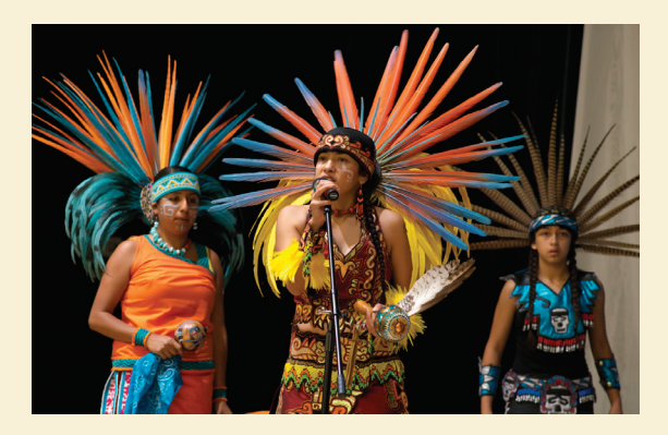
▲ At the 2014 SAYS Summit, students were able to represent and share their culture and community.